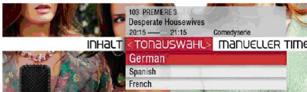
Figure 3. A double focus concept allows users to both navigate horizontally between the items in the options menu (“Inhalt”, “Tonauswahl”, etc.) as well as vertically between the sub-options of “Tonauswahl” (Audio tracks).

1) The 2-level option menu (see last levels illustrated in figure 1) involved a lot of navigation. The intermediate step of going back from level 4 to level 3 was eliminated by introducing a double focus, so that the user can navigate the main items and the sub items without having to confirm the main item.