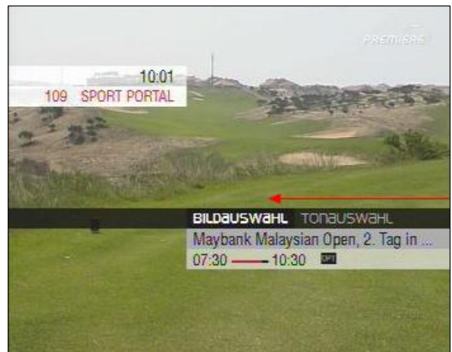
Figure 2. The option menu moves in from the right above the info banner with an animation, which strongly indicates a nonexistent navigation option to the right.