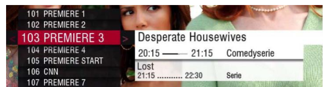
Figure 5. The channel list giving preview on the programs that are on now and next on a specific channel.

The new EPG is a grid that focuses on a visual overview of the upcoming program with visual indication of programs’ lengths and overlapping between programs, whereas the zapper provides information in a simplified list style on the current and most soon upcoming programs, with only little visual cues.